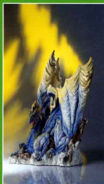
EN 2180 – Kelrass