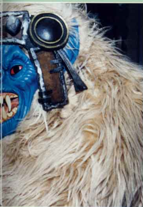
Collectables in Canyon Country, California, pauses to give

Thank you for your patience and continued support for Enchantica throughout the year. It was a year of celebration and a year of transition as all Holland Studio Craft departments packed up and moved to their new locations within Royal Doulton facilities. It is now time to move forward into the next ten years with renewed commitment to quality and service. (Our New Year's resolution to you!)