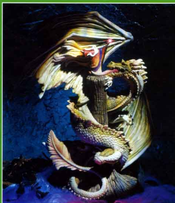
EN 2301 – Confrontation