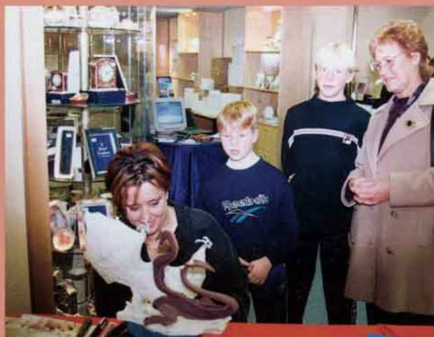
Three members of the "Dragon Lady Fan" Club maybe? - Debenhams - Hanley.