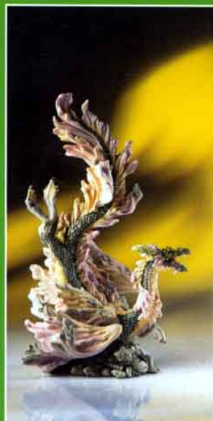
EN 2172 – Ocean Dragon