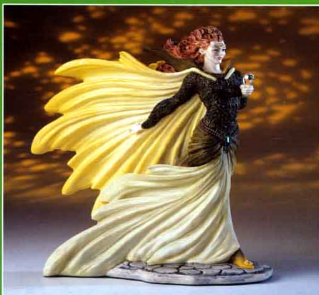
EN 2189 – Bruntian