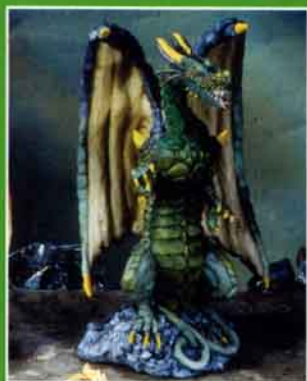
EN 2165 – Infernos