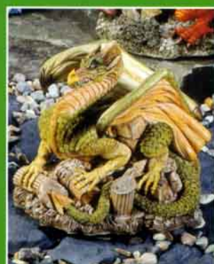
EN 2166 – Cormorin